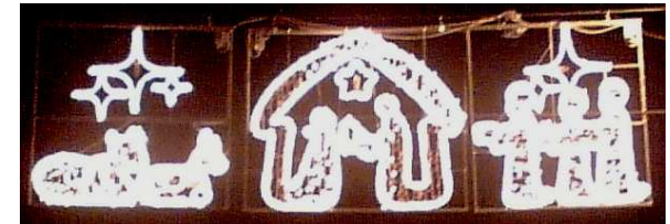
'Nativity' lights first illuminated on Princes Street, Harrogate, 2007